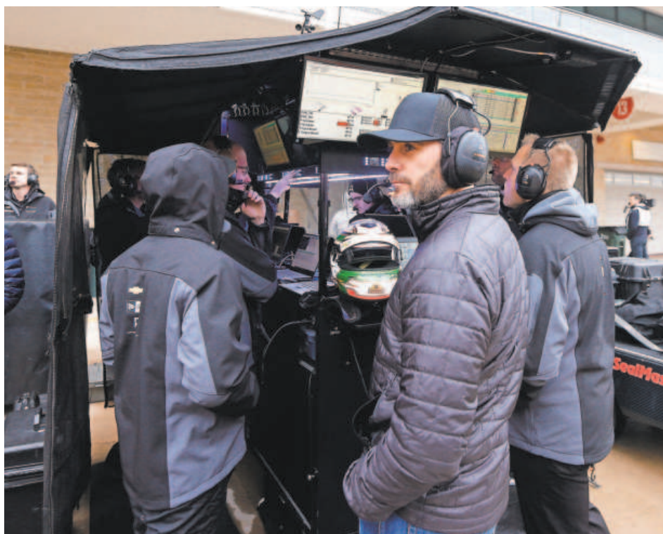
Jimmie Johnson hangs out with driver Robert Wickens during NTT IndyCar Series testing at Circuit of The Americas on Tuesday.

He said he has "closed the door" on oval racing after he's done with the Cup Series.